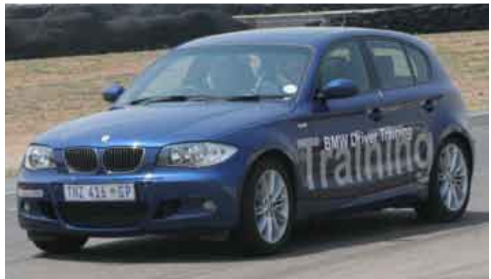
On the Zwartkops Raceway

What turned out to be an exceptional event was a South African barbecue hosted by the Menlyn car dealer. It provided an opportunity to meet BMW Clubs Africa members as well as the local club committees, namely BMW Car Club Gauteng, BMW MCC Pretoria and BMW MCC Central. The Council Meeting attendees’ feedback was that it was great to meet some local owners! Zwartkops Raceway outside Pretoria, a very short and tight track more suitable for Boxer Cup racing, was next on the agenda. Hosted by the BMW Driving Academy using BMW 130i, 330i as well as BMW M3 cars and Minis, the participants were taken through a number of exercises. A special treat was provided by the local clubs showing off their vehicles in a concourse.