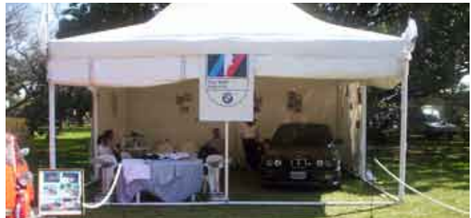
The club stand – contact point for club members and visitors