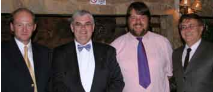
Manpower: our Board members at a glance