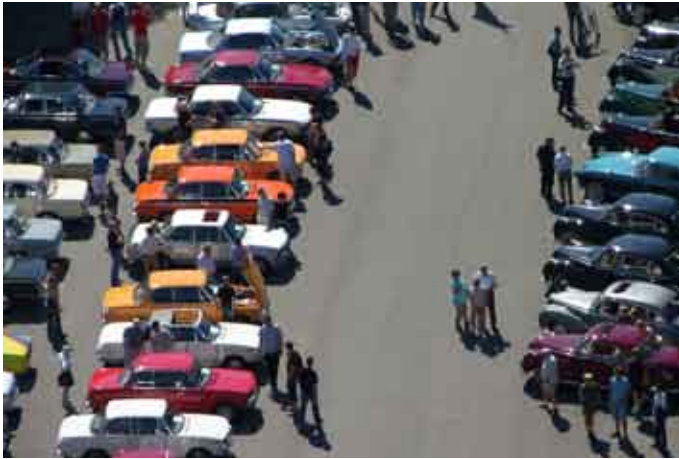
From a distance - everything looks nice