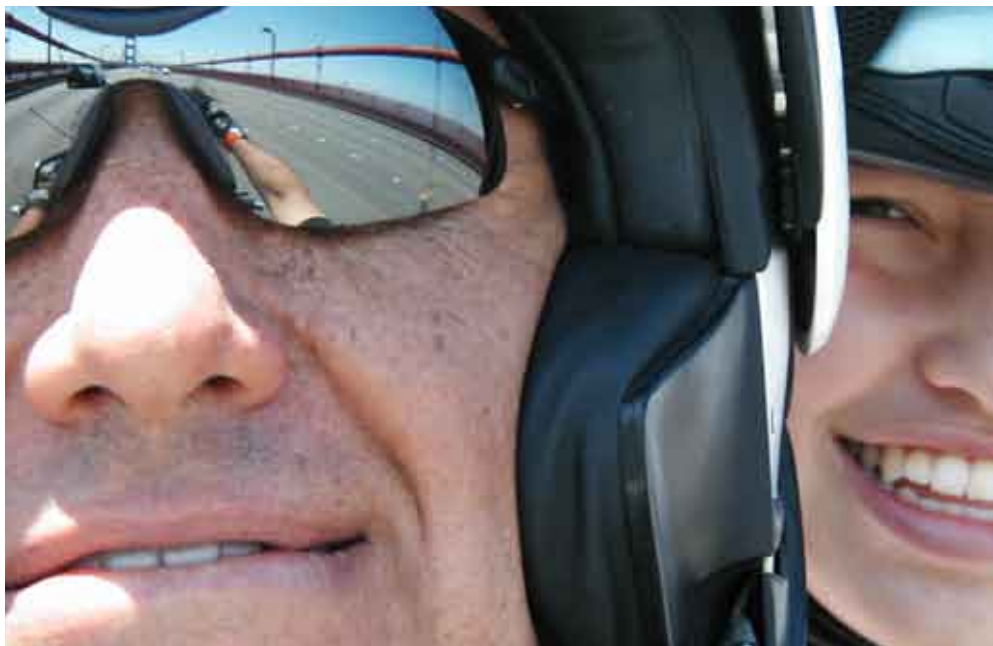
Enjoying the ride

be enough, but on a motorcycle you can go from one place to another very easily. We saw most of the interesting sites there. The bridges, museums, parks and some unique attractions such as Twin Peaks, Fisherman's Wharf, Cliff House, Sausalito and more make San Francisco a delight.