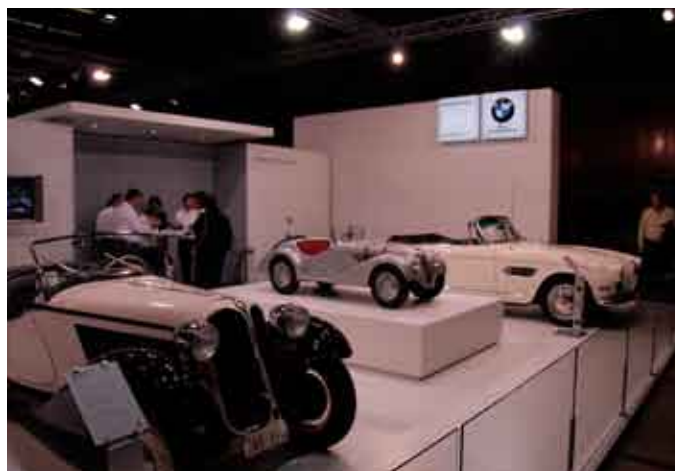
BMW Mobile Tradition presented historical BMW cars

The stand was built in a U shape, offering two different approaches and two different themes. The BMW Mobile Tradition side showed historical BMW cars. The other side was all about the BMW 02, which was no coincidence since it was the 40 th anniversary of this model. Although the model was very popular and still many of them are to be found on the roads, we found some special models which were especially appreciated by connoisseurs, such as the BMW 2002 Diana (of which only 12 were built), a BMW 1600 Karmann (unique model) and the BMW 1600 Baur (exclusive colour “maisgelb”).