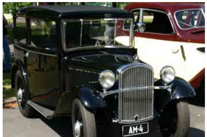
The oldest model AM-4

Almost three hundred stickers with a special 15 th anniversary logo were distributed, one for every BMW. So at least that was the amount of cars that were present. More than 600 club members visited the area. All records of their own sort. After the outdoor gathering, the event continued at the Rantapuisto Hotel where the general meeting was held. The club board presented it's current outlines and plans for club activities and additional topics pointed out by club members were discussed. Overall the meeting was very unanimous, in conclusion it can be stated that the current way of working and the board plans are well received. The evening continued with a "standard" program, dinner and sauna. During the next day some most active club members continued to discuss forthcoming club activities and implementation plans. The discussion will continue later during the autumn, in a meeting for club section heads.