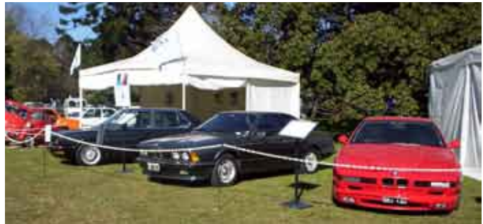
The cars of several club members shone in the Argentinean sun