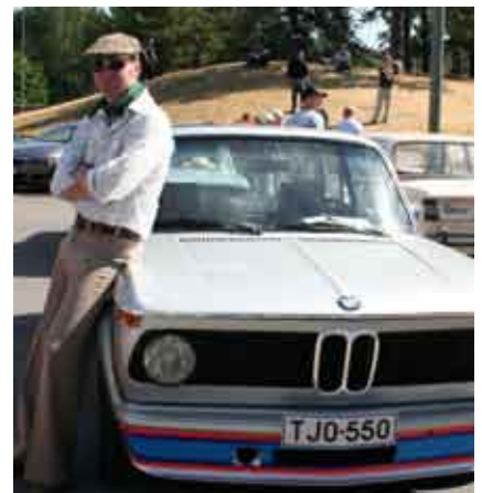
Contemporary partners at the BMW Club Finland's 15 th annual meeting (p. 03)