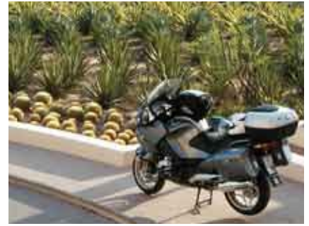
Desert Garden in La Paz (p. 08)

You will also find a current calendar of events on our website at www.bmw-clubs-international.com