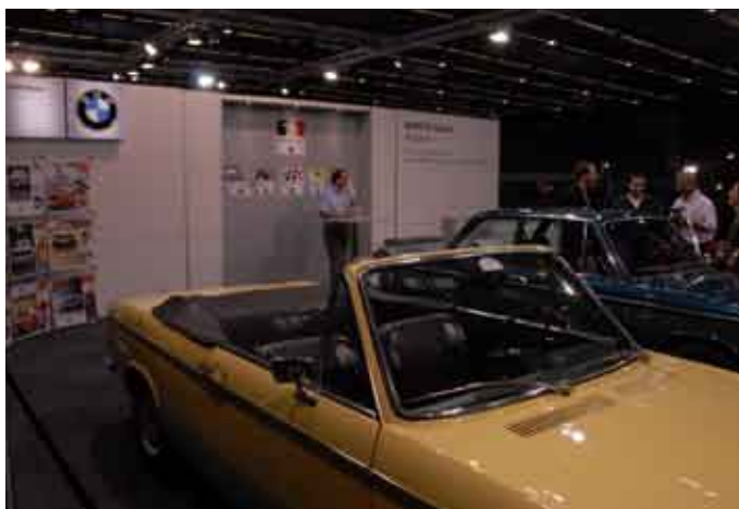
BMW Clubs Belgium stand at the Brussels Retro Festival

Located in the heart of Europe, our small country offers an exceptional range of cultural diversity. This can also be said of the BMW Clubs. BMW Clubs Belgium, the national umbrella, has 5 member clubs, which each have a specific target group. There is one specific classic car club, the BMW Bavaria Club Belgium, but all clubs have classic car interests. So for the major classical event in Belgium, the Brussels Retro Festival, all clubs join forces. Under the patronage of BMW Clubs Belgium and the support of BMW Belux – the national BMW subsidiary – an exceptional teamwork results in a great presence and a fine show on how BMW and BMW Clubs cooperate.