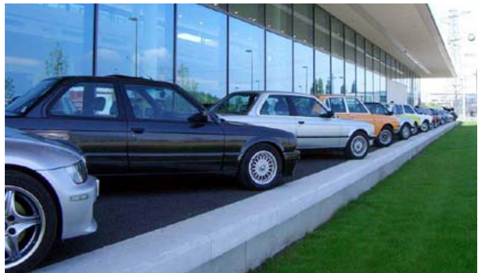
Imposing presentation of the participants automobiles

We set off again next morning. Travelling via Wuppertal and the Neandertal valley, we arrived at the BMW sales subsidiary in Düsseldorf at midday, where we were given a warm reception by the Classic Center team. After taking refreshments, admiring the new BMW Z4 and taking a special little test, we set off once again into the region, among other things passing the Gartzweiler lignite mine. Coming from the deep south of Germany, we couldn't help but be struck by this gigantic destruction of cultivated land for the purpose of generating electrical current.