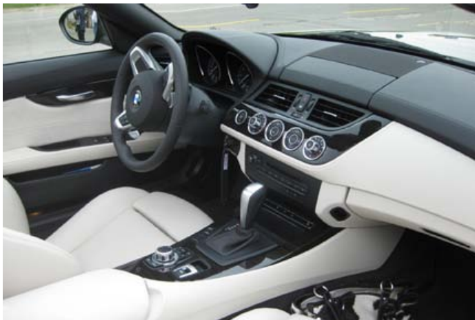
BMW Z4 sDrive 35i with 306 bhp and a torque of 400 Nm

After this introduction and a cup of coffee, the group went to the vehicles and it was time to start the ride in the new BMW Z4.