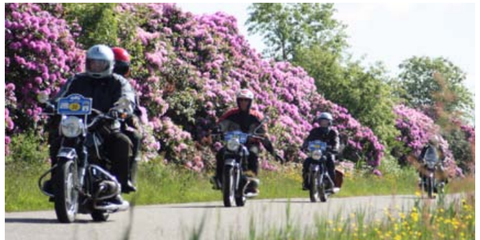
Rolling BMW Museum on the so-called German Fehn Route

Accompanied by the trumpeting orchestra of the induction tract at the rear, we glide along the so-called German Fehn Route on a band of asphalt which glimmers in the sunshine, passing dikes, meadows, hedge banks, protected moor areas and water courses. We cross navigable canals on historic folding bridges, the smooth surface of the water reflecting the BMW classic vehicles as they pass.