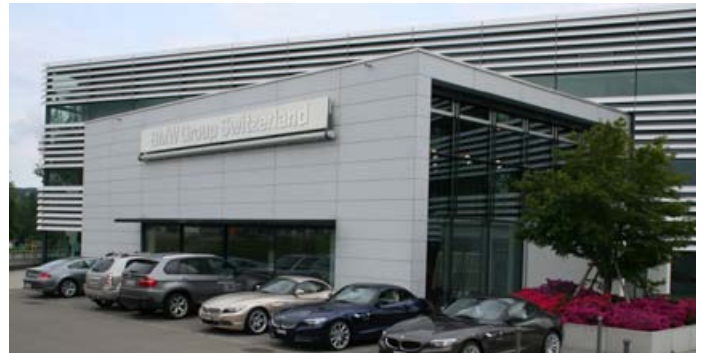
The brand new BMW Z4 in front of the BMW Group Switzerland

400 Nm at 1,300-1,500 rpm. This enables breathtaking acceleration from the very lowest engine speeds. The engine sound is something you have to experience for yourself: your heart instantly skips a beat. Gears are shifted in a fraction of a second by means of a 7-speed dual clutch transmission. Driving dynamics control permits three different vehicle set-ups: the settings Normal, Sport and Sport+ allow the accelerator pedal curve, engine management system and the DSC set-up to be altered. The sDrive 30i has 258 bhp and 310 Nm and the sDrive 23i has 204 bhp and 250 Nm of torque.