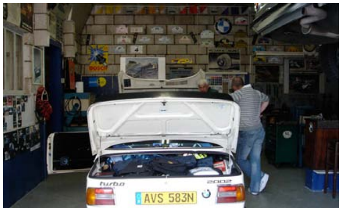
Wim's dream garage with a lot BMW 02 memorabilia

about more turbos. Sunday was checking out time, but Dutch 02 enthusiast Wim offered to take us to his garage and look at my turbo. We followed Wim and then pulled into his drive way to be greeted by a massive old BMW sign on the side of a barn. Inside is Wim's workshop which is a dream garage. He has lifting hoists, pits, a floor you could eat your dinner off, wall to wall BMW 02 memorabilia, all the old BMW diagnostic equipment and a bar! How cool is that?