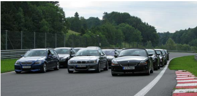
Prior to the start of the obligatory starter lap at the race track

It is now customary for the weather to have a positive impact at this summer event on the beautifully located Salzburgring. Though it was cool and rainy for days before, the clouds cleared on Saturday morning and temperatures climbed to over 25 degrees. So there was plenty of reason to be in a good mood and run a few hot laps on the circuit.