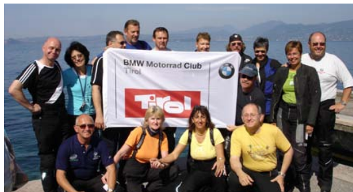
The club members enjoy being on tour together – both in summer and in winter

It was not long before I had gathered together a small group of BMW motorcycle enthusiasts. The first meeting was held in September 1998, and the BMW Motorrad Club Tirol was born.