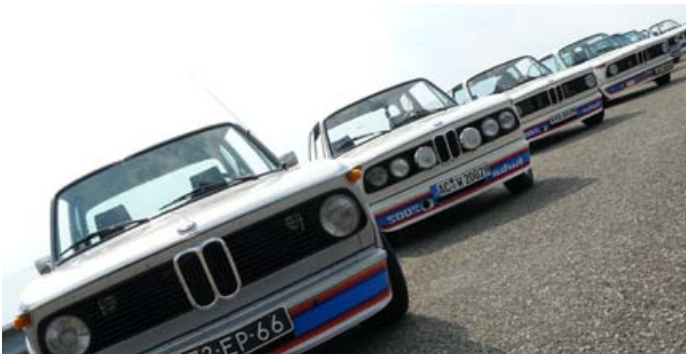
What an impressive view – the BMW 2002 cars of the club members

On the first day we had a busy schedule so we didn't really have the time to look at the car. On the Friday we drove out to the Zuiderzee Museum ( www.zuiderzeemuseum.nl ) via the E22/A7, a road that runs right through the North Sea for approximately 15 miles. It's a strange feeling like driving across the sea. On one side you have the North Sea and on the other a massive man-made lake.