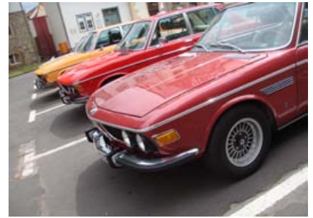
BMW classic cars of the 60's and 70's at the "Neue KlasseTreffen" in Eisenach

You will also find a current calendar of events on our website at www.bmw-clubs-international.com