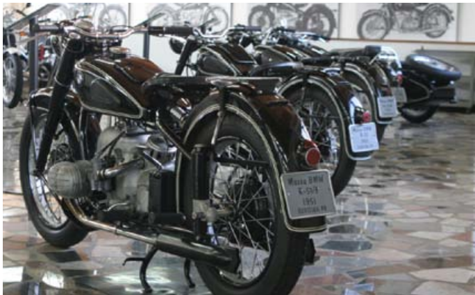
Simply fascinating – Motorcycle museum of Curitiba

Being a great success of concurrency and results, where friendship emerged instantly and spontaneously, six countries came together: Argentina, Brazil, Chile, Costa Rica, Mexico and Uruguay.