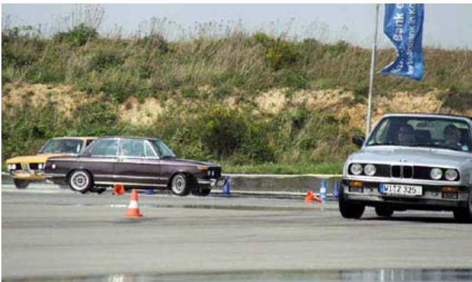
The participants had a lot of fun during the driver training course

After a short briefing, the driver training course began. Right through to the afternoon we slammed on the brakes, cranked the steering wheel and swerved our way around the track like there was no tomorrow. Refreshments were served in between – after all, those driving classic cars without power steering needed to recharge their batteries once in a while! Since the water used to sprinkle the grounds was hard, the cars were given a good wash afterwards.