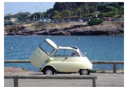
With the Isetta from Paris to southern France