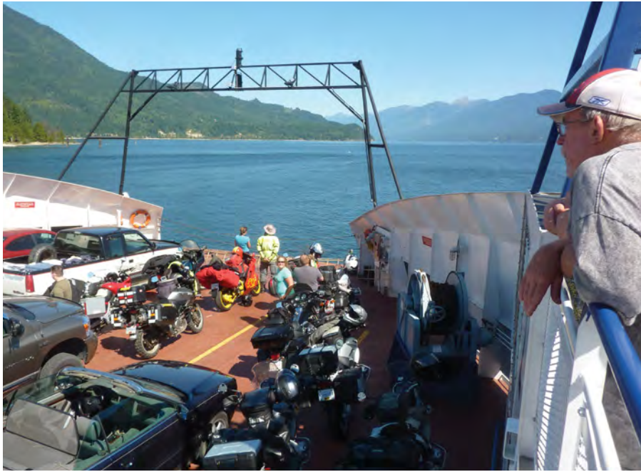
The Kootenay Lake Ferry between Kootenay Bay and Balfour is the longest free ferry ride in the world.

(Originally published in BMW Owners News Dec 2011)