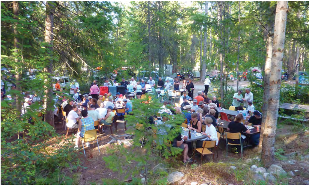
Banquets used to be in a hall with silver tablecloths; food tastes even better at the sunshine outdoors in Nakusp