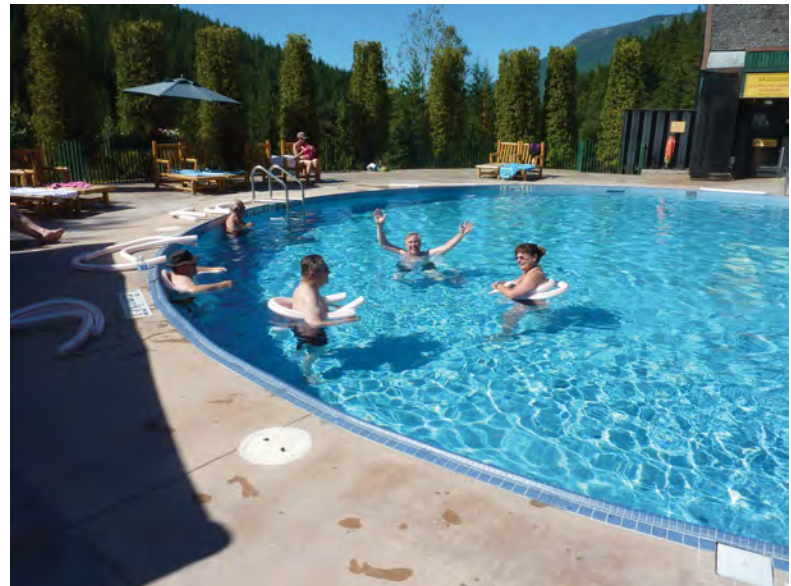
The Nakusp Hot Springs refresh the soul while the ride to it refreshes the spirit.