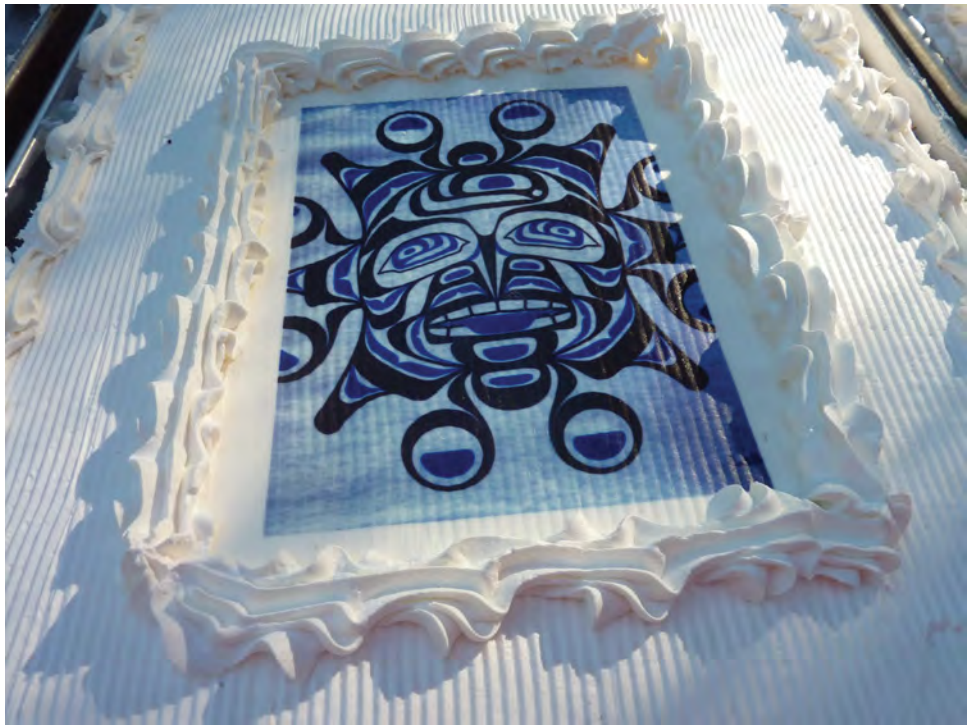
Unique Rally Logo on delicious cake. Chocolate!